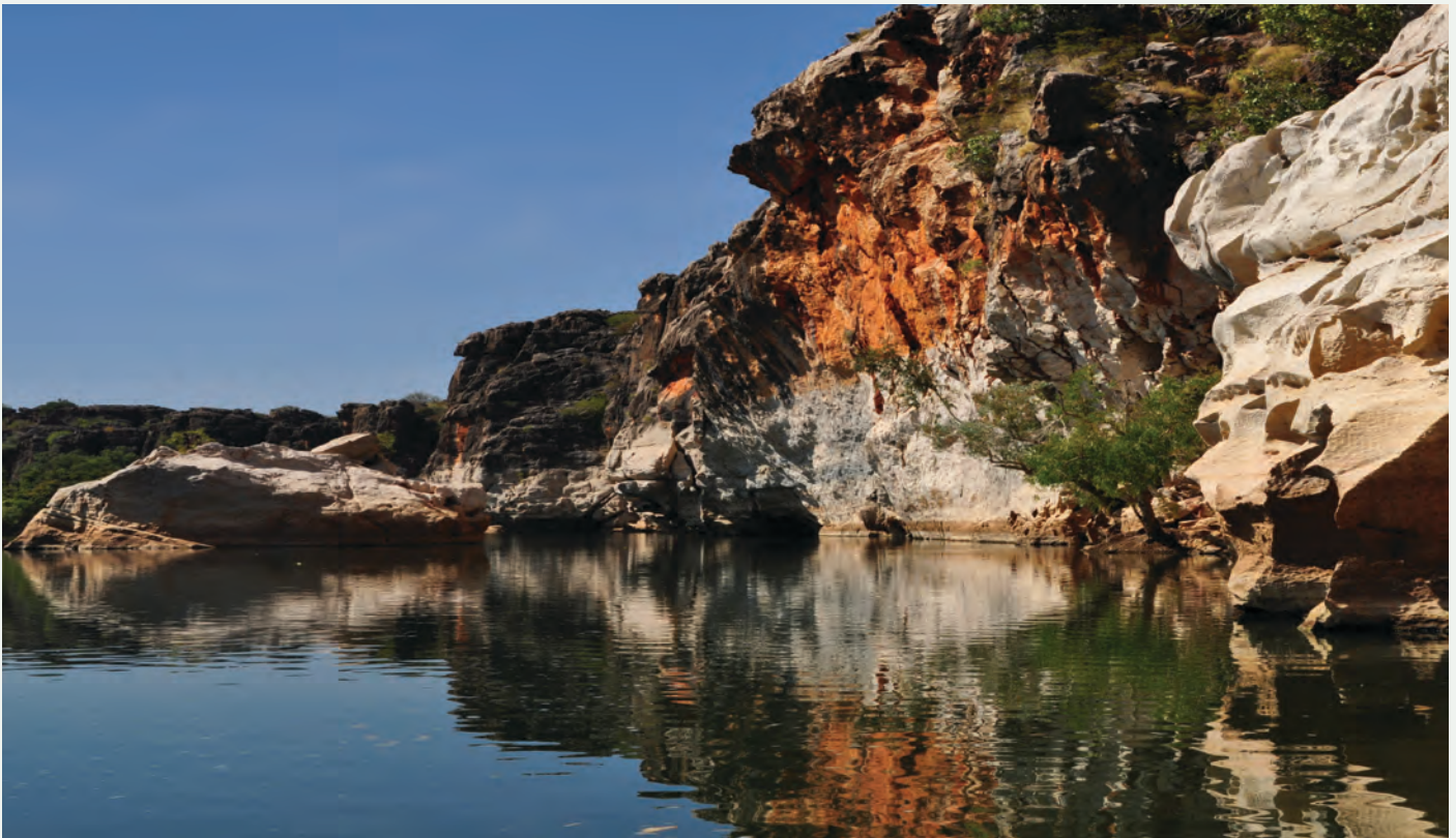
Dangku (Geikie )Gorge