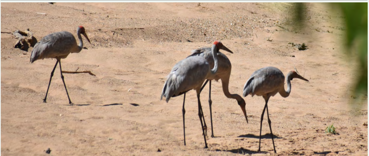
Brolgas at Windjana Gorge